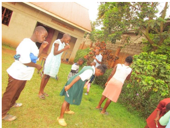
Trainees brushing teeth

Under this activity I do teach some trainees how to use sponge and soap while bathing. I also help them to brush their teeth.