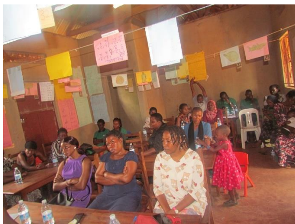
Parents attending the workshop