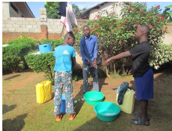
Some trainees washing their clothes mopping

I do mopping every morning in some classes