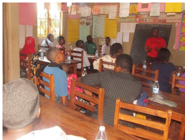
A parent sharing her experience with others