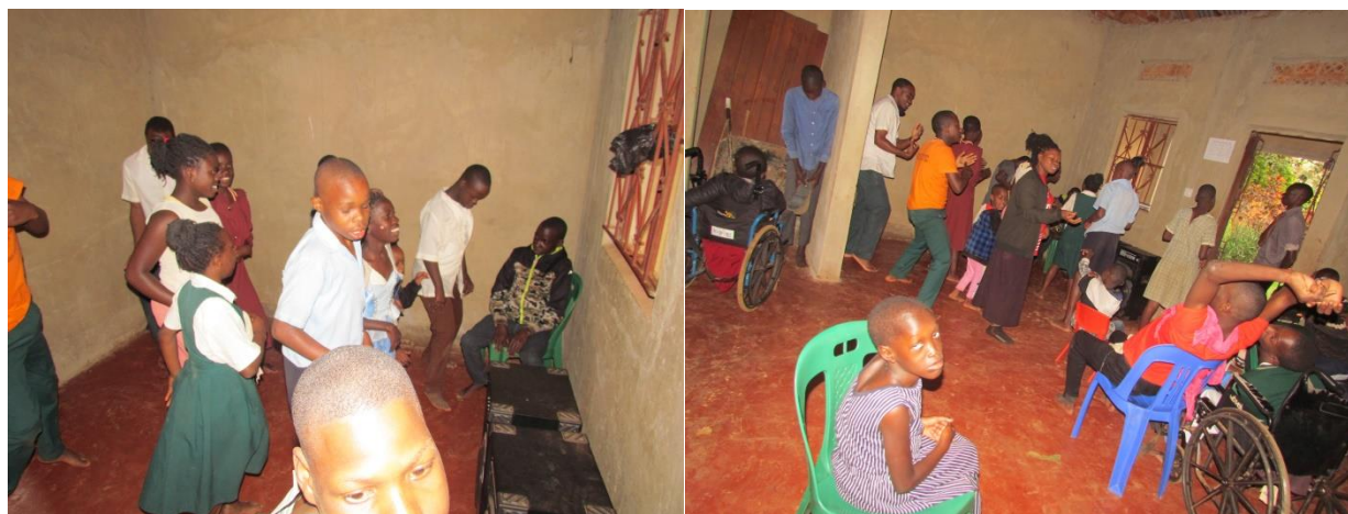
Dancing class at BISTC

The dance sector involves performance of the various kinds of dances, both western and traditional, hence the children are expected to learn how to dance. But just as it is for the music sector, only a handful of students are able to dance. The majority are hindered by their disabilities as explained below.