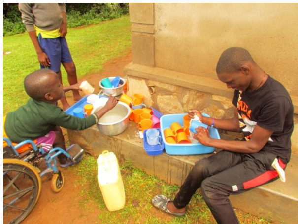
Trainees washing utensils

I monitor the trainees to wash the clothes, in this I teach them how to apply soap onto clothes, wash and to hang clothes onto the wire.