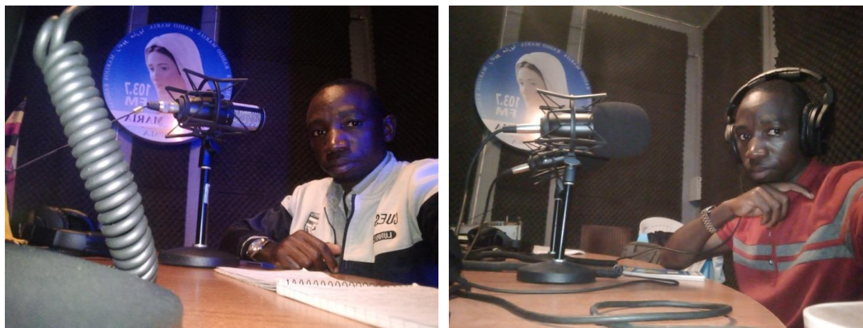
Fig. 1& 2 While in Radio Maria Uganda's studios for live programs about disabilities

Mental Rehabilitation Program: SEECHILD has tremendously continued to tirelessly carry on the mantle of organizing and transporting the patients with mental problems to Butabika Hospital for medication and reviews every month. The number of people that subscribe to this service has shot high and in a little while, we shall need to have a bigger vehicle or use two trips every month. This portrays that the programs has deeply been understood and hence masses have appreciated its relevance within our community and beyond.