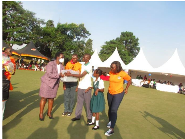
Manager with trainees receiving the first aid