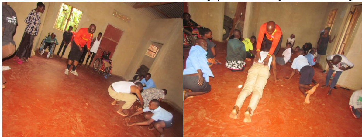
Our trainees in a physical training session Some of our trainees resting in wheelchairs and standing frames..

On our curriculum we have included physical training and hair plaiting.