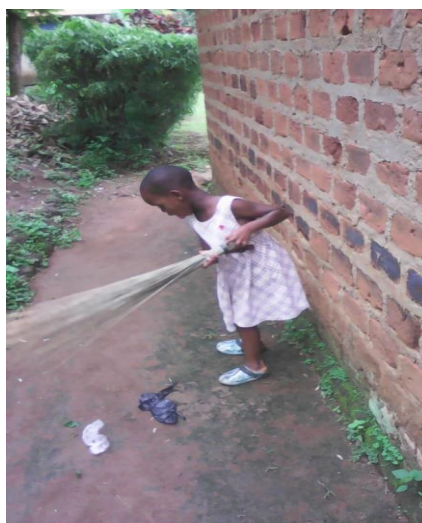
Precious initiating sweeping at her own.