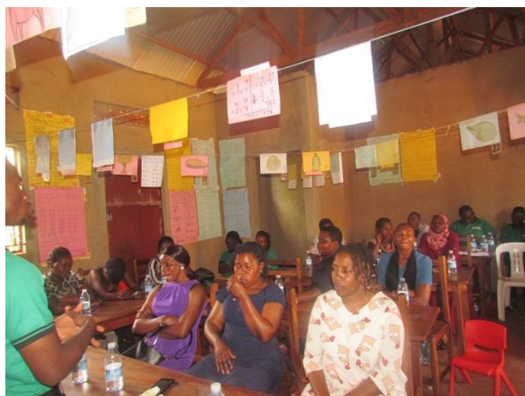
Some of the parents during the workshop