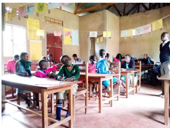
The trainees attending literacy lessons in the morning.

Literacy training. The staff is continuously committed and dedicated in teaching practical skills, knowledge and experience to their trainees on a one to one based approach of imparting skills to children, this approach has helped the trainers to win the children's confidence with ease and the children are gradually coping up with their learning disorders. The purpose of literacy training is to enable the child to develop communication skills to transact his or her normal businesses with ease. The skills also will enable the children with disabilities to become less dependent on their parents or caretakers.