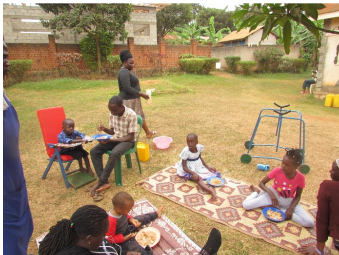
Some trainees during lunch time