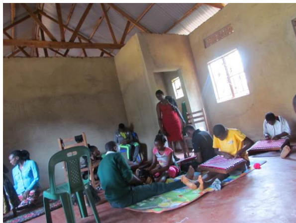
Trainees practicing plaiting in Class.

Anna excels in table cloth making and only needs to perfect few things.