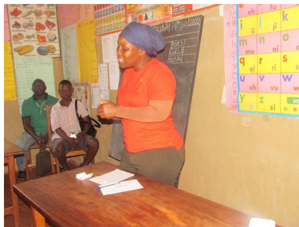
A mother talking to fellow parents in the workshop