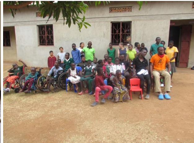
The family of Ddungu C with the trainees at BISTC.