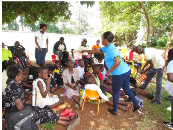
BISTC Trainees at Lugogo